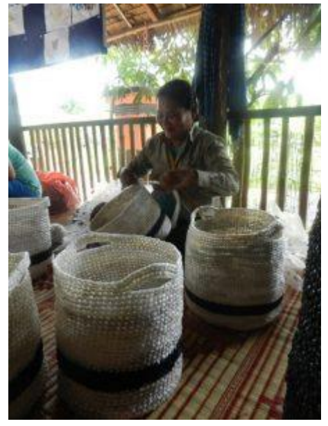
One of the ladies at the weaving workshop